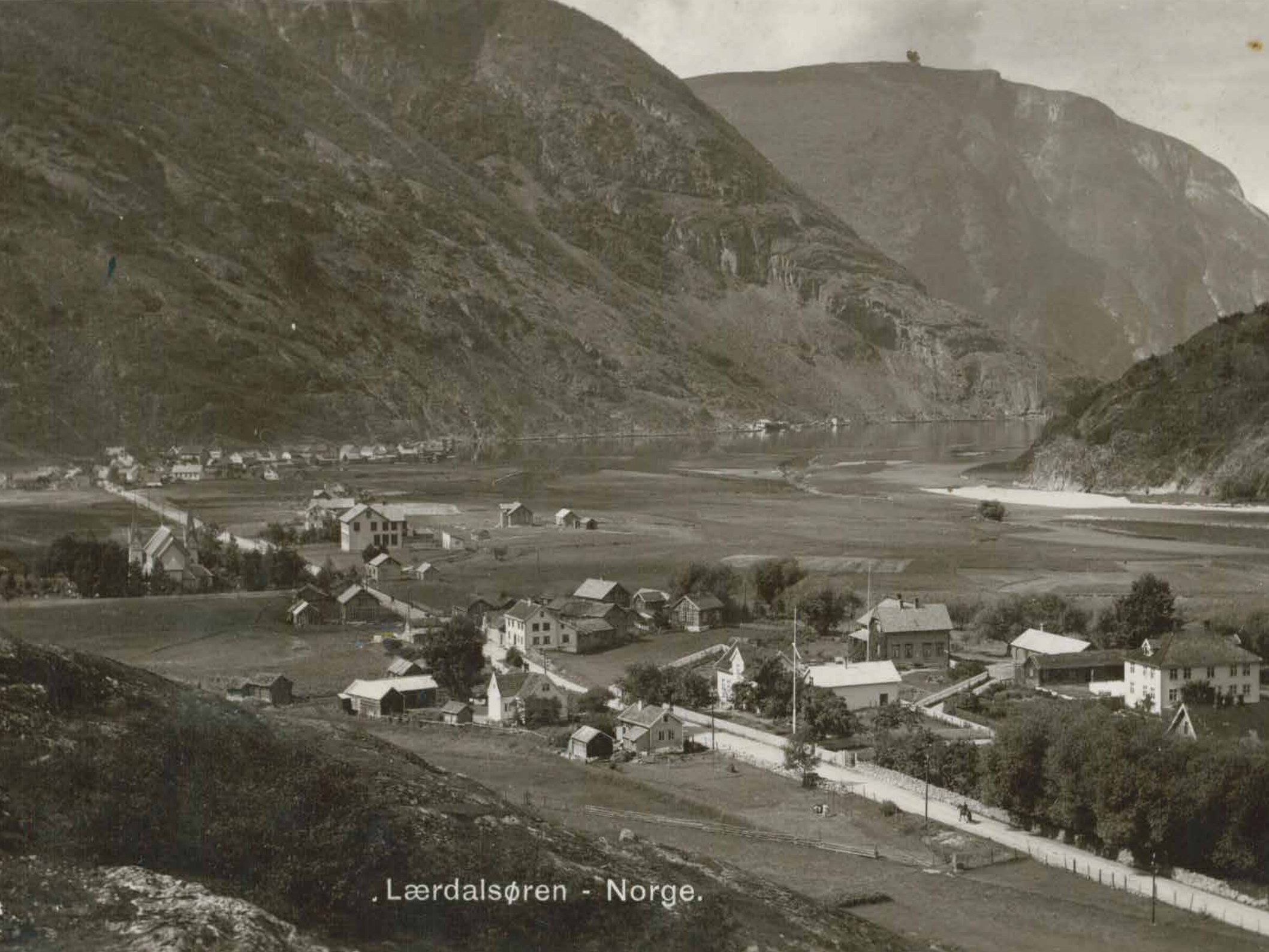
Lærdalsøren - Norge.